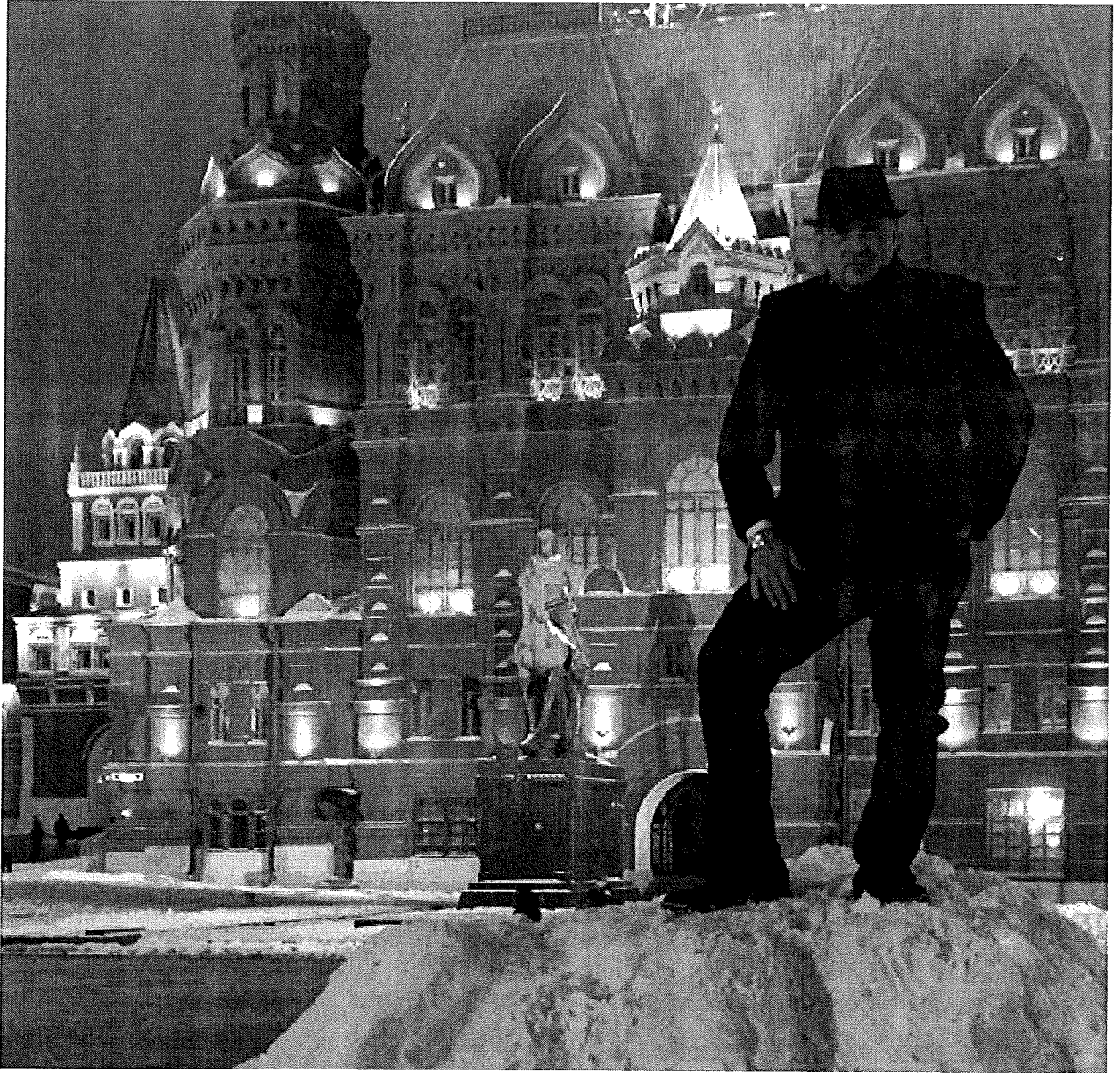
Alchwiki posing in Moscow

ALCHWIKI WORKING IN TANDEM WITH IRGC-OF TO PROVIDE FUNDS TO HIZBALLAH AND HAMAS